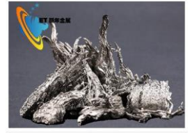
金属铟 CAS NO.7440-30-4